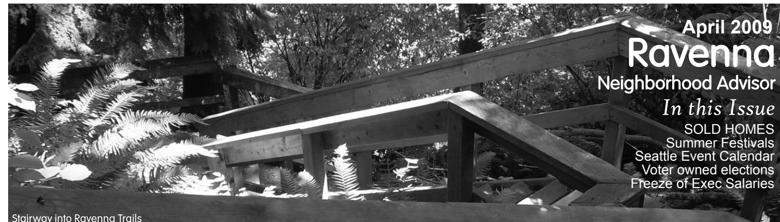
Stairway into Ravenna Trails