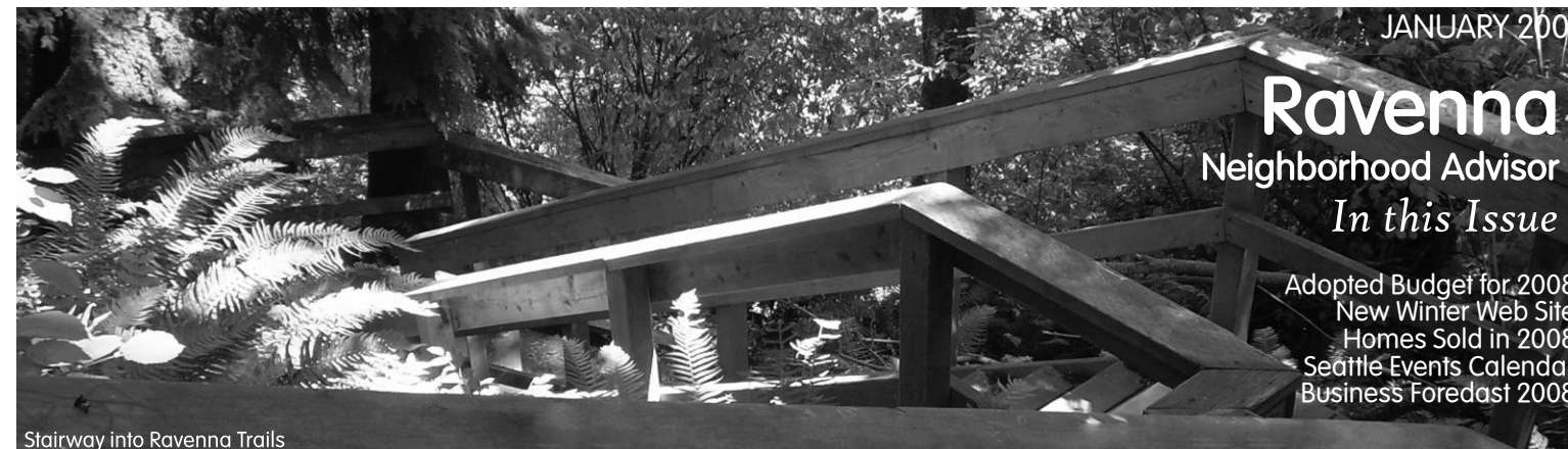
Stairway into Ravenna Trails

Windermere Windermere Real Estate / Oak Tree, Inc. http://www.ravennahouse.com