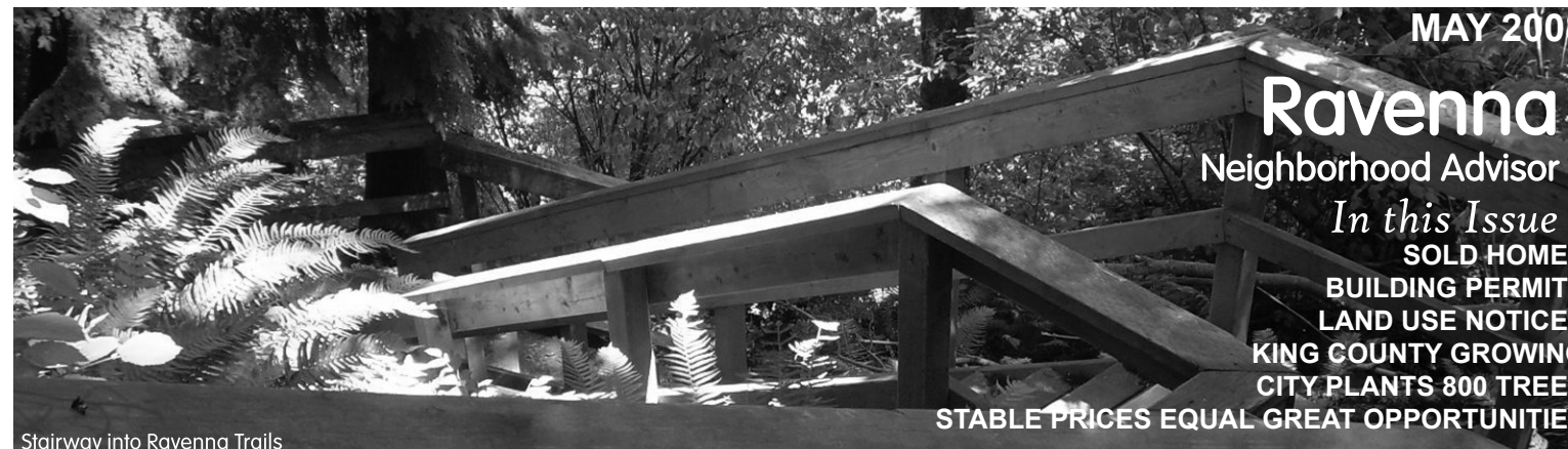
Stairway into Ravenna Trails